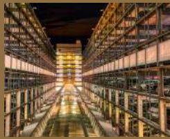
MULTILEVEL CAR PARKING